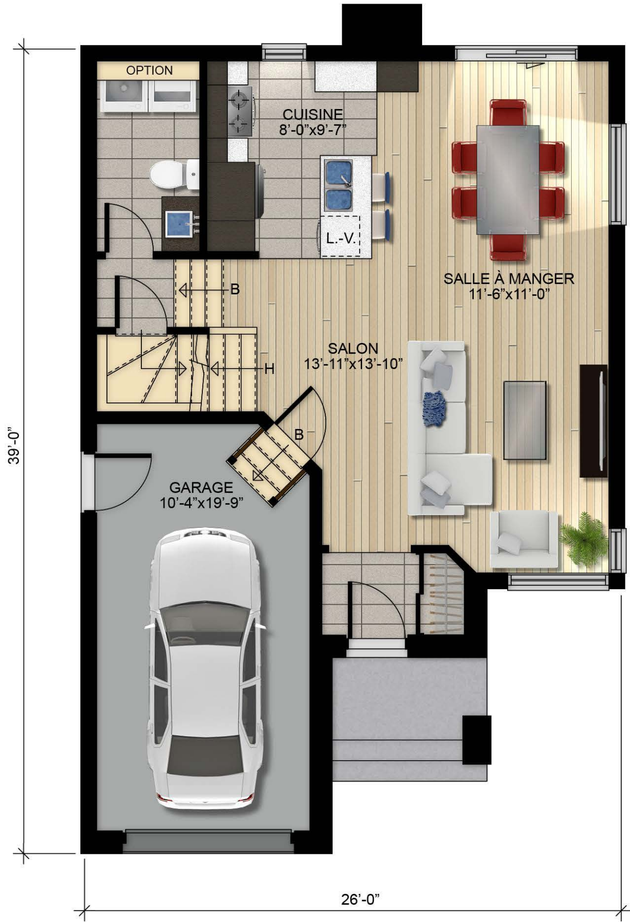
REZ-DE-CHAUSSÉE 619 pi 2